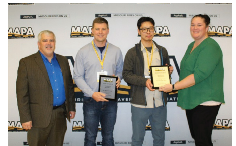
2nd Place - Maintenance N.B. West Contracting Route M • St. Genevieve County