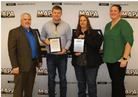
2nd Place - N.B. West Contracting US 50 • Franklin County