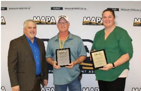
2nd Place - Pace Construction Route N • Stoddard County