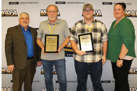
1st Place - Herzog Contracting Group I-35 • Daviess County