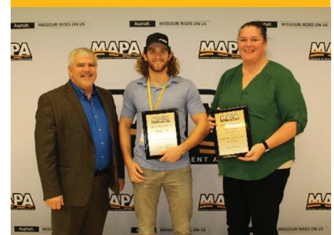
1st Place - Missouri Petroleum Products Fulton City Streets • Callaway County