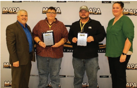
2nd Place - Emery Sapp & Sons Main Avenue • Polk County