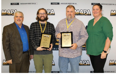
1st Place - Superior Bowen Runway 18-36 • Clay County