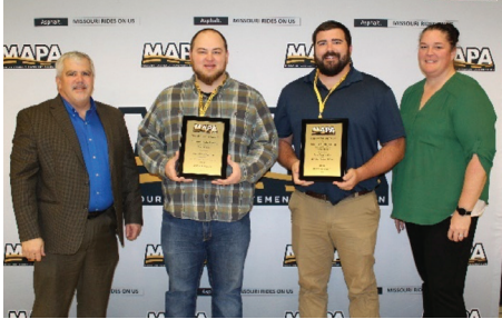
1st Place - Pace Construction US 61 • St. Charles County