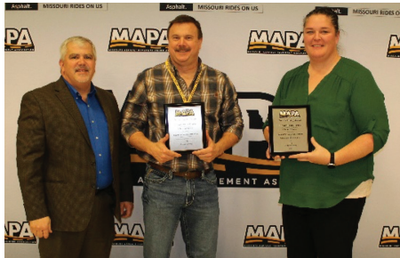
2nd Place - Capital Paving & Construction I-70 • Cooper County