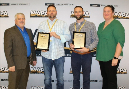
1st Place - Pace Construction Mexico Road • St. Charles County