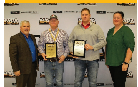
1st Place - Capital Paving & Construction Walmart Parking Lot • St. James, MO