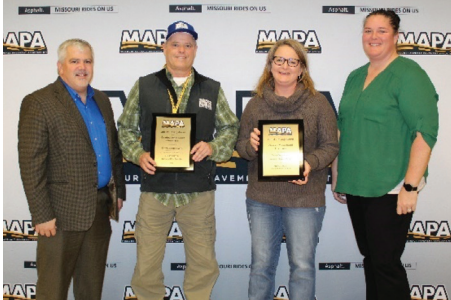
1st Place - Emery Sapp & Sons MO 79 & US 54 • Ralls and Pike Counties