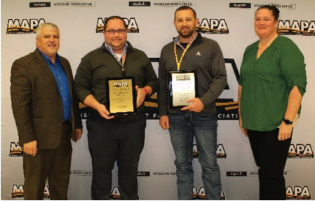
1st Place - Capital Paving & Construction South Airport Drive • Boone County