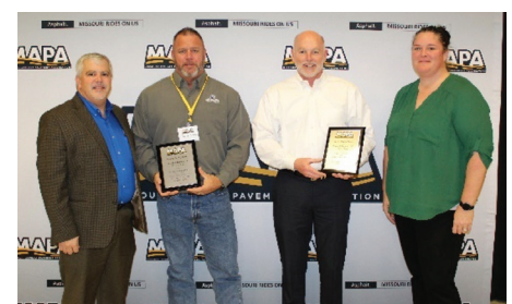
2nd Place - E. Meier Contracting St. Albans Country Club • Franklin County