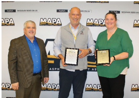
2nd Place - Ideker, Inc. International Airport Base • Platte County