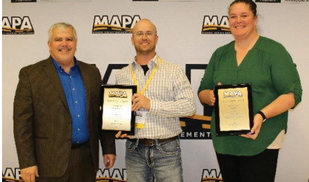
1st Place - Ideker, Inc. MO-7 • Jackson County