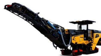
BOMAG MILLS/ROLLERS/SOIL STABILIZERS