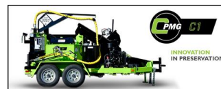
CIMLINE CRACK SEALERS