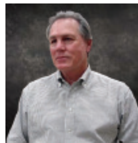
Ned Yost Kansas City Royals Manager

Along with education, the conference gives you a fantastic opportunity to network with peers and meet other industry professionals.