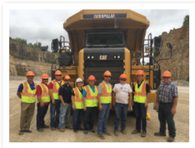
Legislative Tour – Williamsville Quarry

The first step is to invite your legislator(s) to visit one of your facilities. You must do this every time you communicate with the legislator(s) or a member of their staff. Every time! It's not hard. Just say, "We would like to extend an invitation to you and your staff to visit us." We issue an invitation when we visit them in Washington, D.C. or Jefferson City. We invite them through emails and letters.